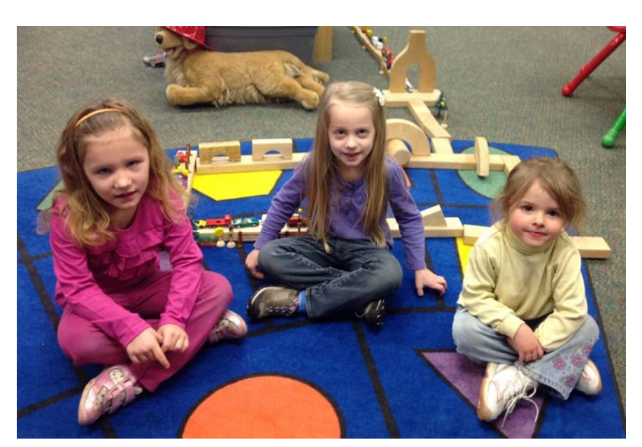
Students enjoy the Early Learning Play Group.