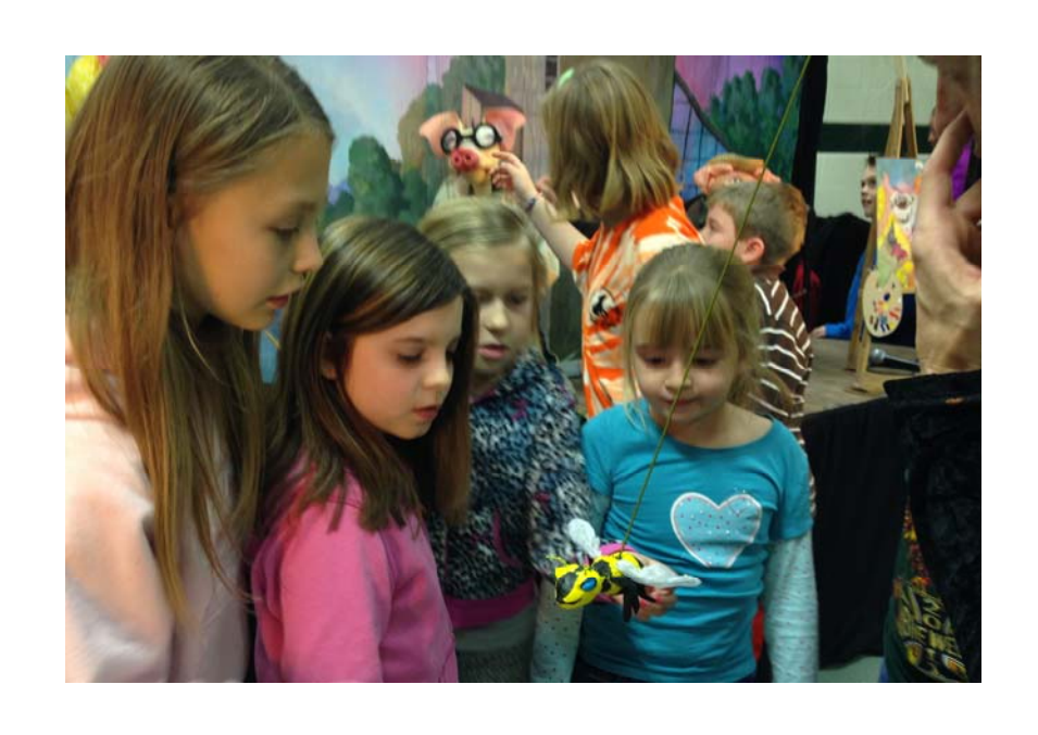
2013 SCHOOL REPORT