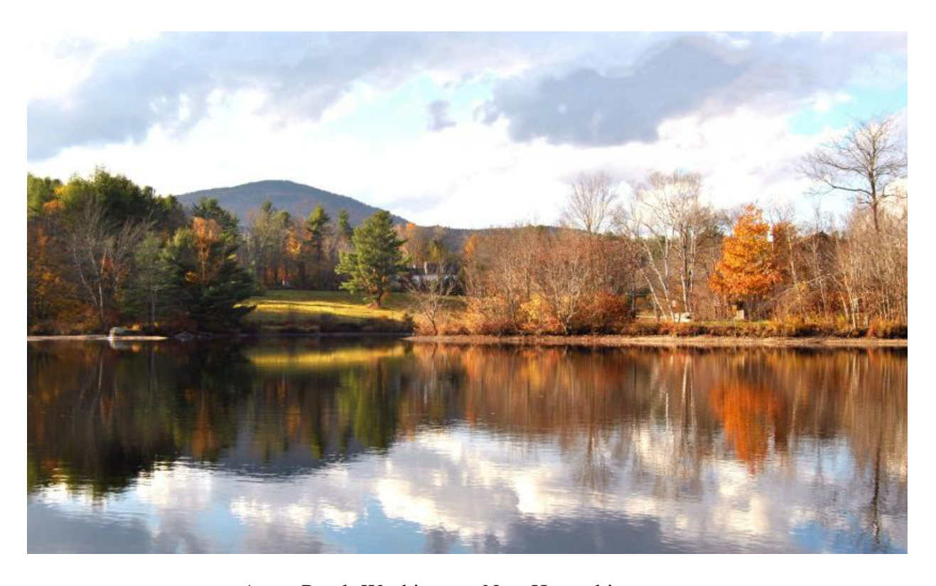
Ayers Pond- Washington, New Hampshire